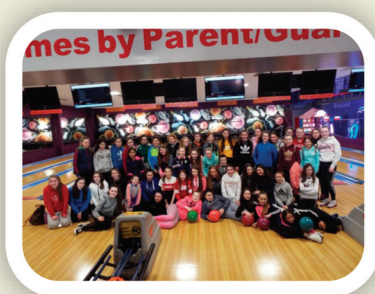
First Years enjoying a morning in Bowling

Pictured below are First Years enjoying a morning of fun in Bowling Buddies as part of a Wellbeing Day